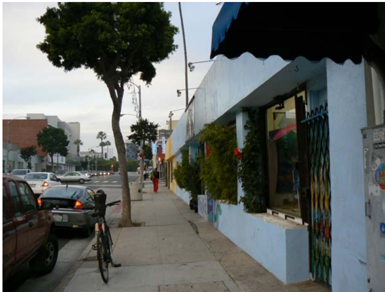
Entrance to Jeff Ho's Former Studio and Shaping Room (Foreground), View to North.