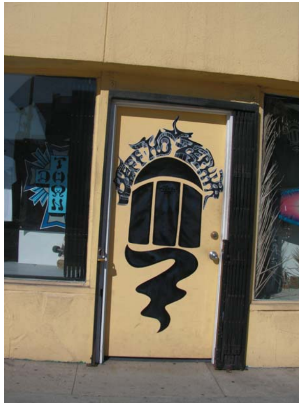
Door to Skateboard Shop at 2001 Main with Z-Boys Insignia, by Tony Alva, View to East.