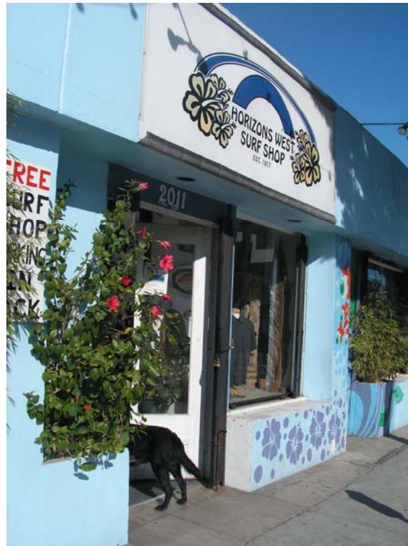
Main Entrance to Surf Shop, View to Southeast.