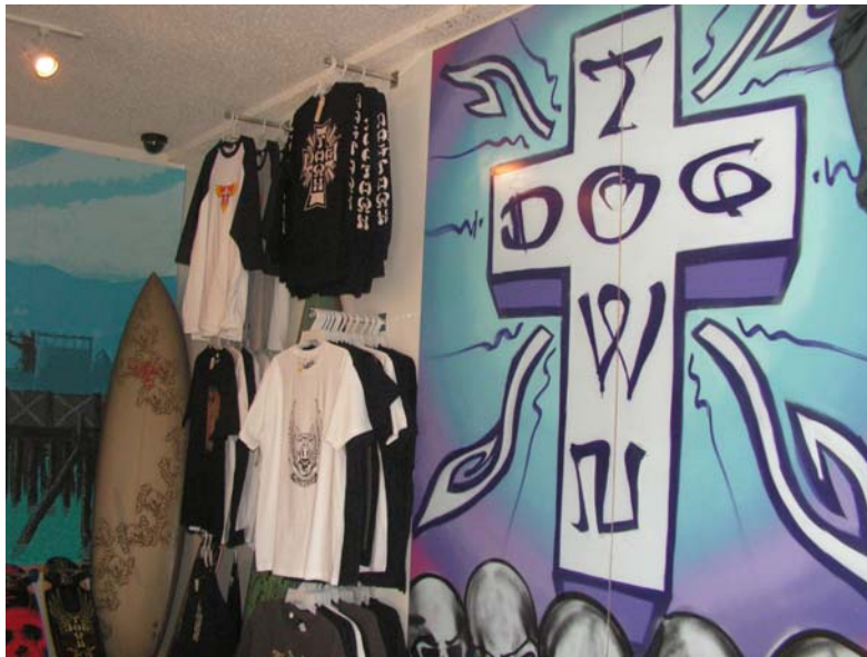
Interior, 2001 Main, Dog Town Cross Painted on South Wall, View to Southeast.