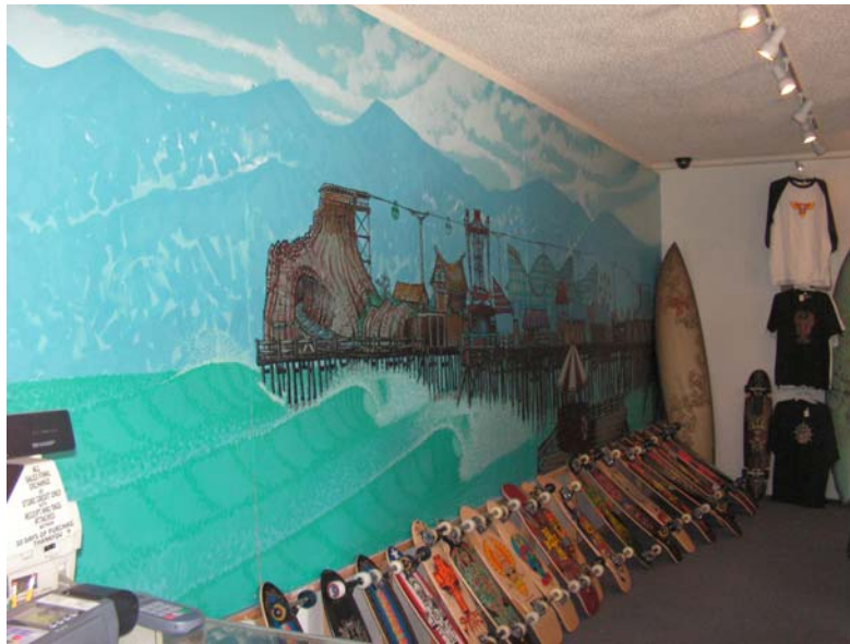
Interior, 2001 Main, Mural Painting Showing the Pacific Ocean Pier. Skateboards and a Jeff Ho Surfboard are Below and to the Right of the Mural. View to Southeast.