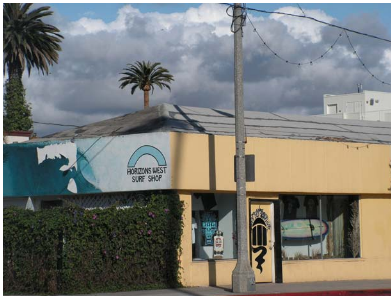
Skateboard Shop, View to Southeast.