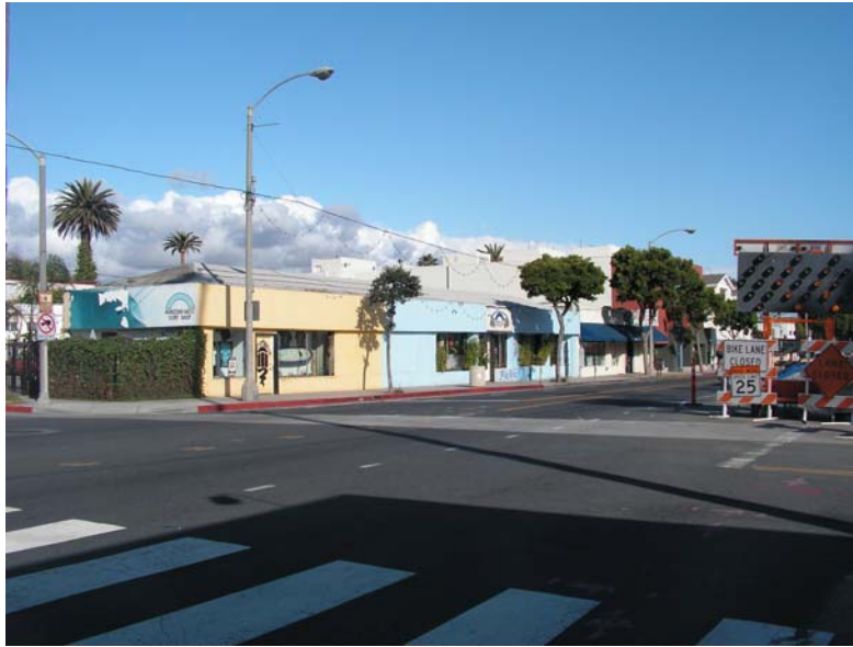
General View, 2001-2003 Main Street, View to Southeast.