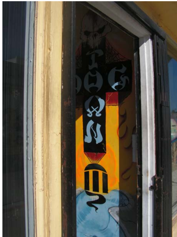
Dog Town Cross Painted on Wall Adjacent to Front Door, 2001 Main, View to Southeast.